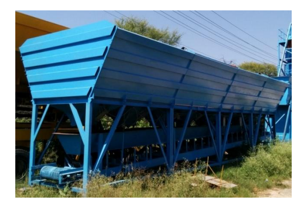
A FOUR STORAGE HOPPER AGGREGATE SUPPLY SYSTEM WITH 15 M<sup>3</sup> HOPPERS

The aggregate supplying system is compact and reliable. The sand is fed by one hopper of 15 m<sup>3</sup> capacity each while the aggregates of various sizes are fed through three storage hoppers of 15 m<sup>3</sup> capacity each. All hoppers are equipped with pneumatically controlled gates discharging the material onto the weighing trough conveyer fixed below.