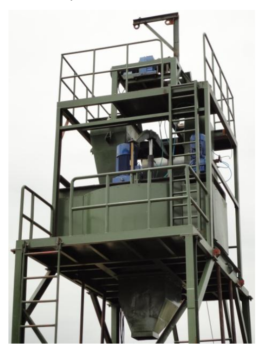
ROTARY PAN PLANETARY MIXER

The rotary pan mixing technology is the latest adaptation within the field of concrete mixing. A planetary rotary pan mixer provides a comprehensive mix of concrete within a minimum time period. The concrete mix is delivered directly to the transit truck via chute.